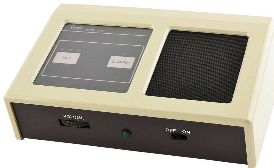
Model D-15 Mainstation 79-9236-3421-2 479DB